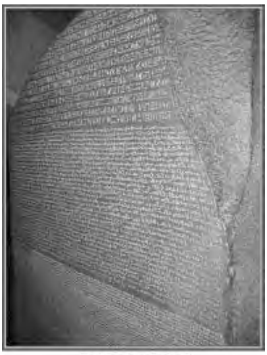
Fig 7. The Rosetta Stone

An important discovery that significantly helped advance Egyptian archaeology was the discovery of the Rosetta Stone in 1799, named as such for being found at Rosetta. Napoleon's army was attacking Egypt and as they were rebuilding a fort they came across a black basalt stone about four feet tall. The stone had three different languages on it, at the top was hieroglyphic, in the middle was demotic and at the bottom was a Greek script. Each one of these parts told the same story using a different language. The Rosetta Stone was carved in 196 BC during the reign of Ptolemy V (205 - 180). Jean-François Champollion, a Frenchman, deciphered the hieroglyphs by 1822. He was able to crack the code from the Greek to the demotic and then finally to the hieroglyphic