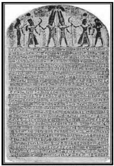
Fig 4. The Merneptah Stele

The most important mention of Israel outside the Bible is that in the Merneptah Stela (fig. 4). Discovered in 1896 in Merneptah's mortuary temple in Thebes the stela is a eulogy to pharaoh Merneptah, who ruled Egypt after Rameses the Great, 1236-1223 BC. Of significance to Biblical studies is a short section at the end of the poem describing a campaign to Canaan by Merneptah in the first few years of his reign. One line mentions Israel: "Israel is laid waste, its seed is not." Here we have the earliest mention of Israel outside the Bible and the only direct mention of Israel in Egyptian records. This puts Israel as a nation right after the conquest of Canaan by Joshua (1406 BC) and speaks of the desolation of Israel during the time of the judges.